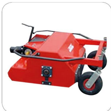
Flail mower attachment for 2 wheel tractor